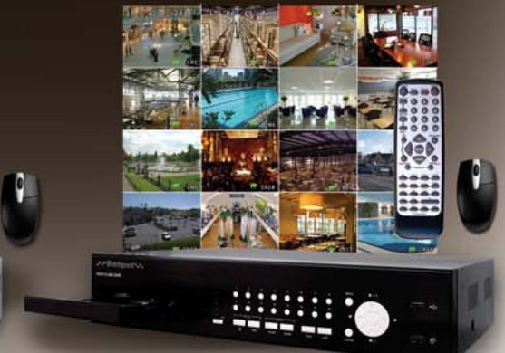
WATCHGUARD 16 Channel DVR Model No: DVRWG16ES