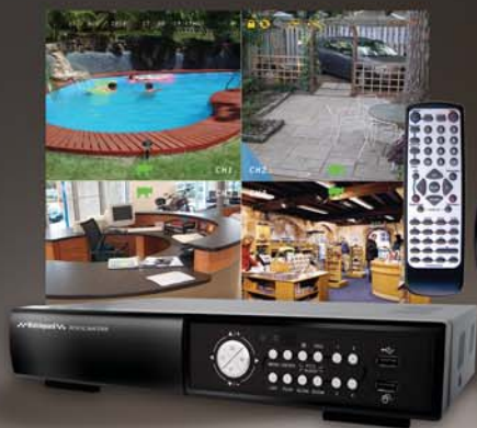
WATCHGUARD 4 Channel DVR Model No: DVR4CHSOV6H264