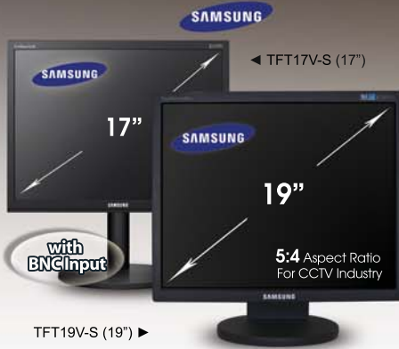
TFT19V-S (19") ▶