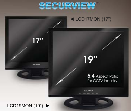
LCD19MON (19") ▶