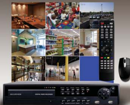
SECURVIEW 8 Channel Standalone DVR Model No: DVRSVIEW8100H