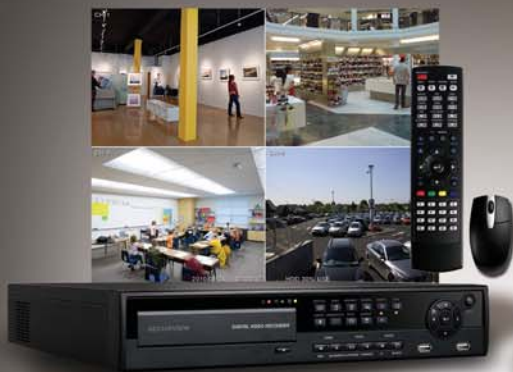
SECURVIEW 4 Channel Standalone DVR Model No: DVRSVIEW4100H