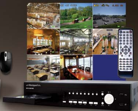
WATCHGUARD 8 Channel DVR Model No: DVRWG8ES