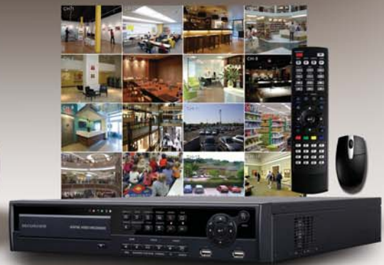
SECURVIEW 16 Channel Standalone DVR Model No: DVRSVIEW16100H