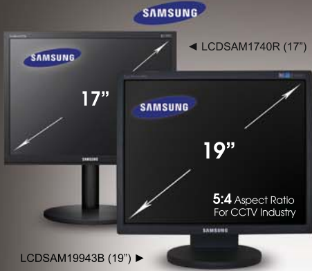
LCDSAM19943B (19") ▶